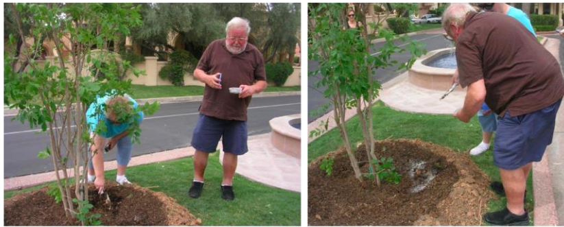
A parent's farewell.